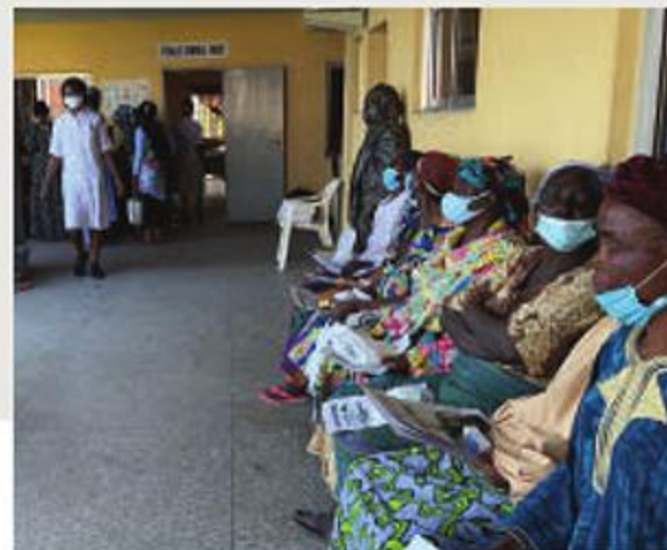
Rotary Club of Lagos Island

45% OF CASES OF BLINDNESS AMONG PEOPLE AGED 50 AND OLDER ARE CAUSED BY CATARACTS